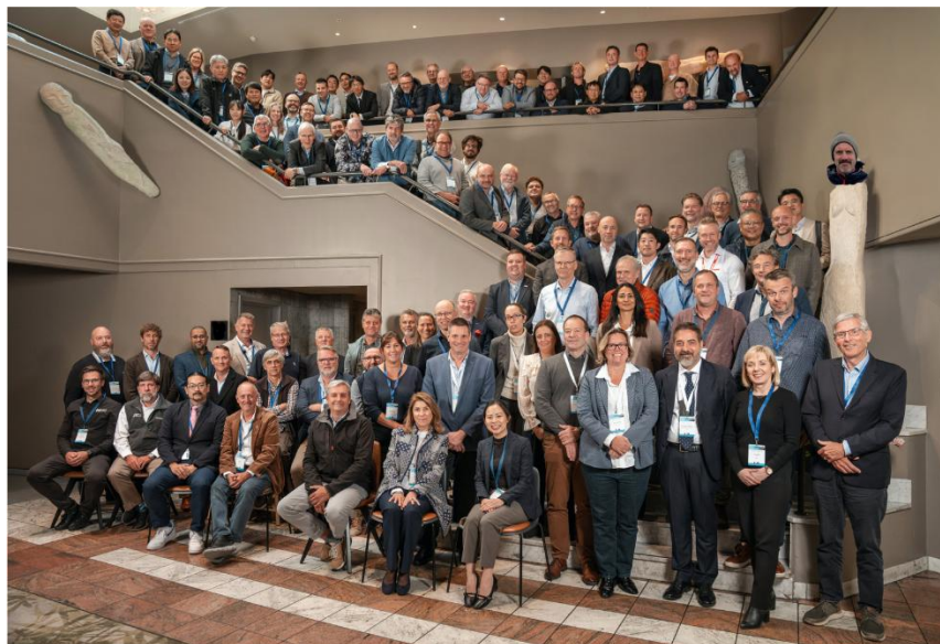
IRSO 36 th group photo, Bergen, Norway