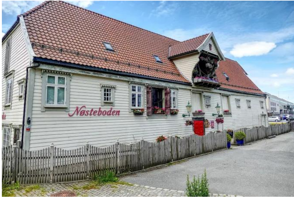
Nøsteboden, venue of the IRSO icebreaker.

An informal icebreaker was held at Nøsteboden, an historic venue originally constructed as a boathouse circa 1645. The event provided delegates with an opportunity to network and reconnect ahead of the formal meeting and was generously sponsored by Kongsberg.