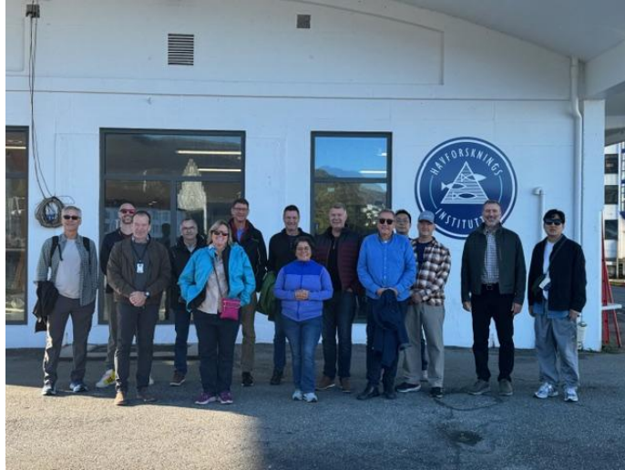
Tour of IMR.