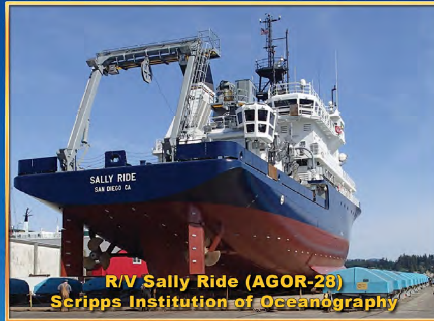
R/V Sally Ride (AGOR-28) Scripps Institution of Oceanography