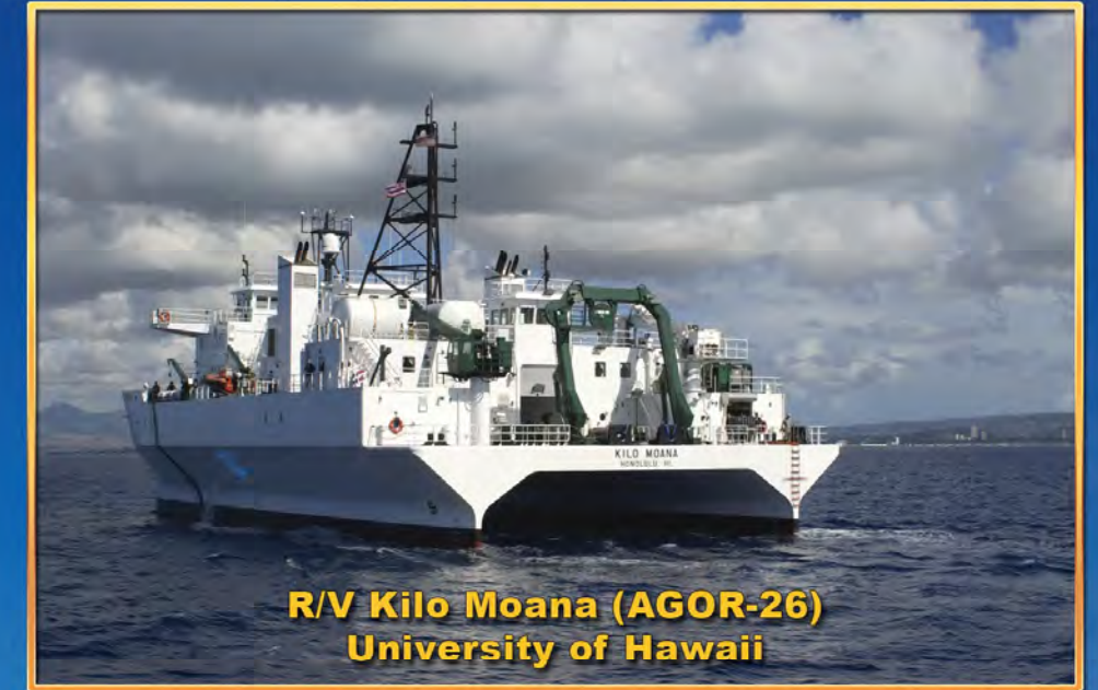
R/V Kilo Moana (AGOR-26) University of Hawaii