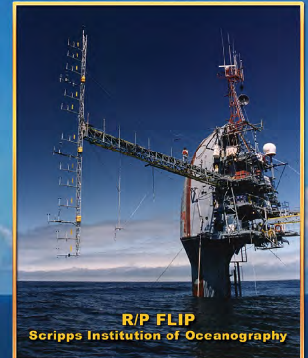
R/P FLIP Scripps Institution of Oceanography