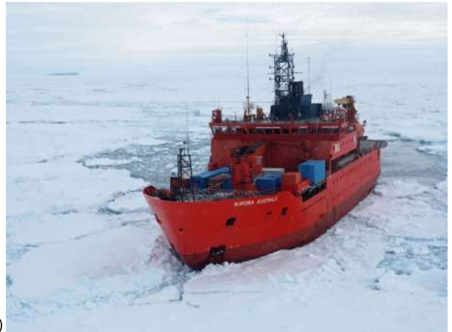
Aurora Australis